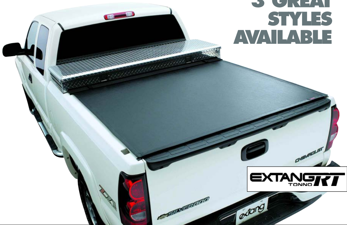
EXTANG RT TONNEAU